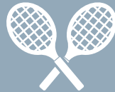
Squash & Tennis Court